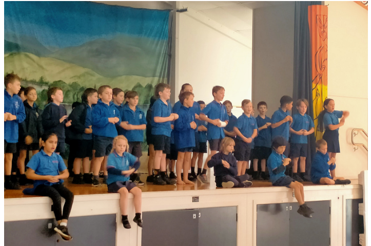
Miro Production Practise