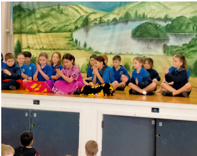
Room 8 sharing a pasifika item that our Cultural leaders have taught them to celebrate Samoan Language Week

If we have any concerns with your child's progress your classroom teacher will contact you before the end of this term to discuss them.