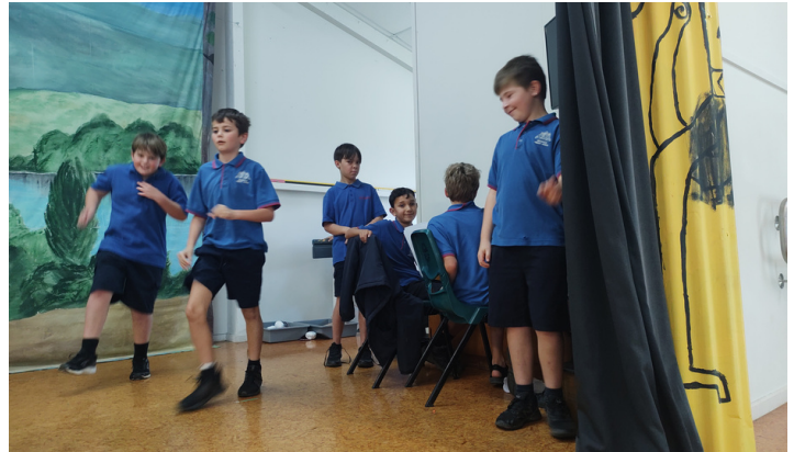
Rata Production Practise