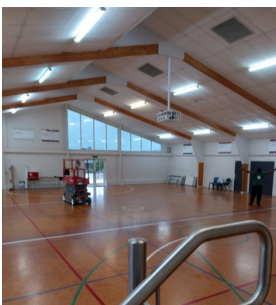
In the hall: lightbulbs replaced, filters cleaned and new glass replaces the grates in the doors.