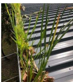
All gutters were cleared.