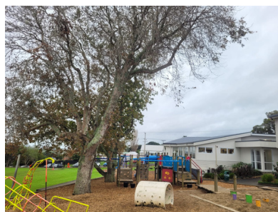
The tree over the playground had branches with stress fractures in. These have been removed.