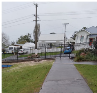
Sadly the tree was rotting so was removed