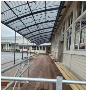
New Benches outside Rooms 10, 11 & 12

It has been go, go, go since our last newsletter and you may have noticed a few developments around the school.