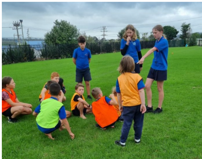
Our Sports Leaders running a game with younger students