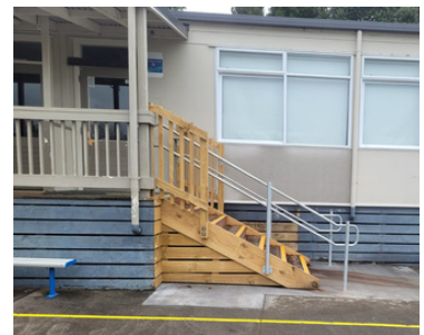
The steps outside Room 21 are now completed