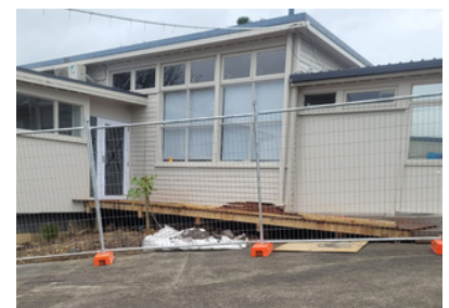
A ramp now leads away from the new toilets for ease of access.