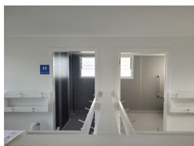
A new disabled toilet and unisex toilets behind Room's 3 & 4.