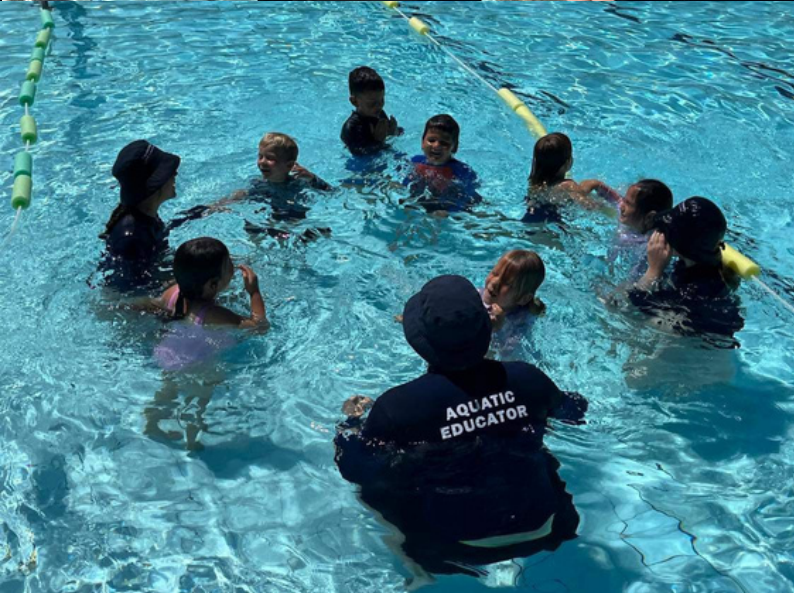
Kōwhai and Karaka Teams have started their swimming lessons. The children are enjoying these and learning through fun games and challenges