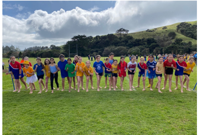
Our Year 6 girls about to start their race at Cross Country last week.