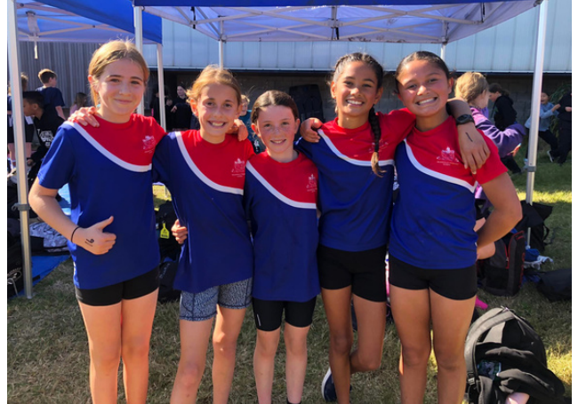
A few of our awesome North-West cross country competitors