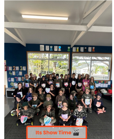
It's been a busy end to the term with the fitness challenge and production